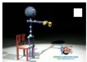
Whole body free squat