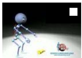
Whole body free squat

To find out more about Body Back-Up & Flex-a-Stretches - visit our Home Page and the link to YouTube