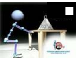
Whole body squat

Lying Down Exercises are best done on a firm surface - such as a carpeted area